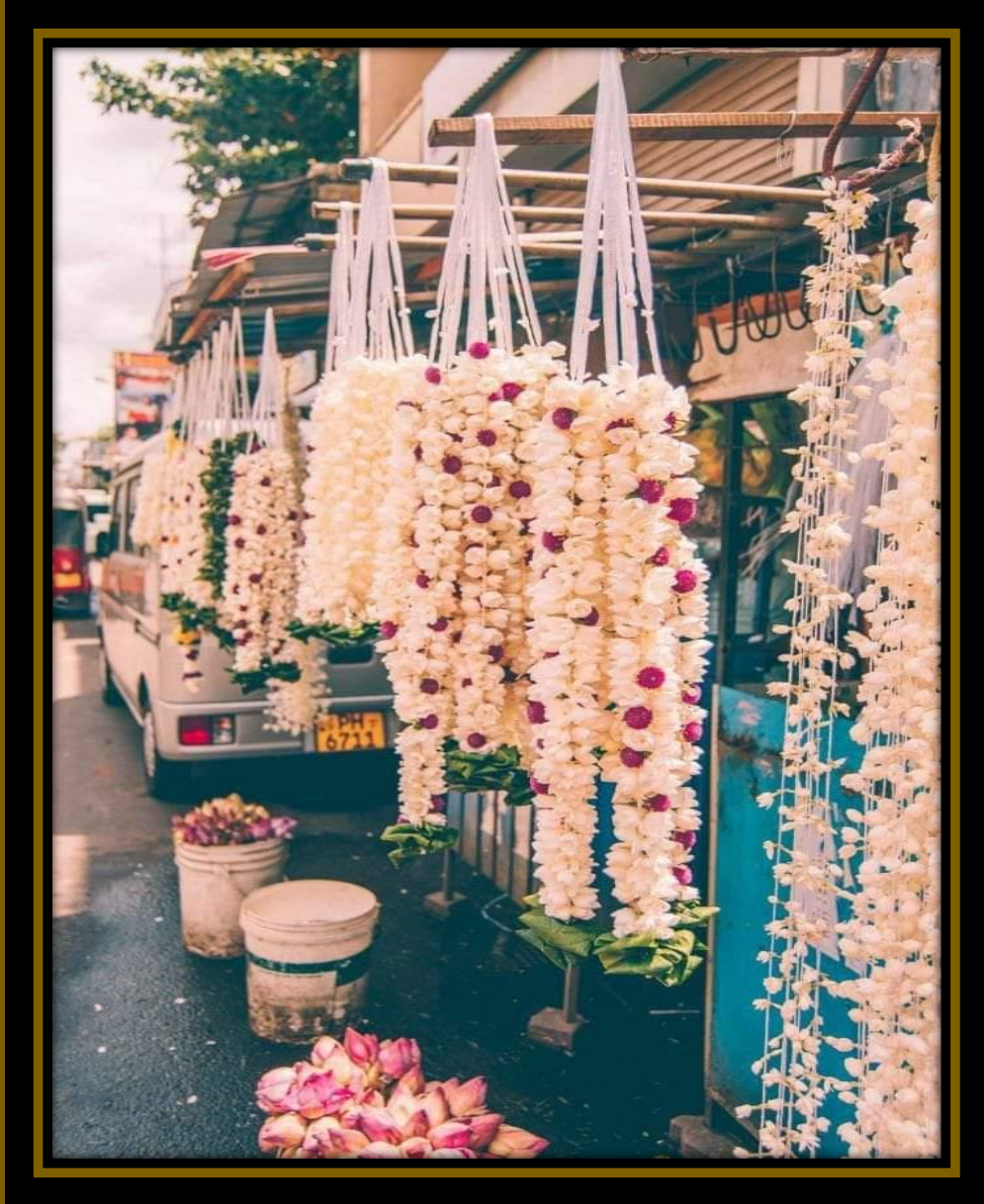
The stall with fragrant flower garlands of Jasmine and Marigold in Colombo street, next to the historic Hindu Temples.